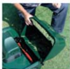
Grass compactor doubles the box capacity.

The safety switch and full-width control bar, that engages the rear roller, are designed for operator comfort and the fold-down handle enables compact storage. When you need to change the cutting height, a simple flush-mounted adjuster allows you to do so in seconds with a simple turn of the dial and gives 5 pre-set cutting heights and one for scarifying. The Windsor – an ideal choice for gardeners who take pride in their lawns.