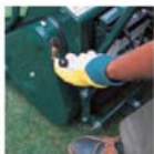
Blade disengagement lever.