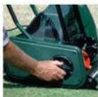
Five preset cutting heights at the turn of a dial. Plus a setting for scarifying.