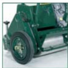
Side wheel kit available