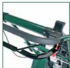
Comfortable throttle control and three-way drive

The spring tine comb also lifts the grass prior to cutting to ensure an even cut, and a nickel-chrome plated front roller and heavy steel rear roller produce those beautiful, classic stripes that are the hallmark of an Atco lawn. Manoeuvrability on the larger 17" and 20" models is further enhanced by a split differential on the rear roller. The Balmoral is controlled by a three-way drive facility which allows the blades to be disengaged without stopping the engine, convenient for emptying the grassbox and for powered manoeuvres around the garden. Also, when mowing in awkward corners or around trees, you can disengage the drive for manual control. Features such as foam-cushioned handles, a larger, more manageable throttle and micro-set cutting height adjuster are all designed to make mowing the lawn a positive pleasure. The Balmoral, available in 14", 17" and 20" cutting widths.