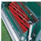
Micro-set height-of-cut adjustment.

If you require the best finish a mower can provide whether in your garden or for bowling greens, cricket pitches, tennis courts or croquet lawns the Royale and Club are the best that money can buy.