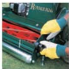
Simple-to-use height-of-cut adjustment.

The Royale – truly a king amongst lawn mowers.