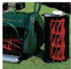
A 10-bladed QX™ cutting cassette is available for more frequent cutting.